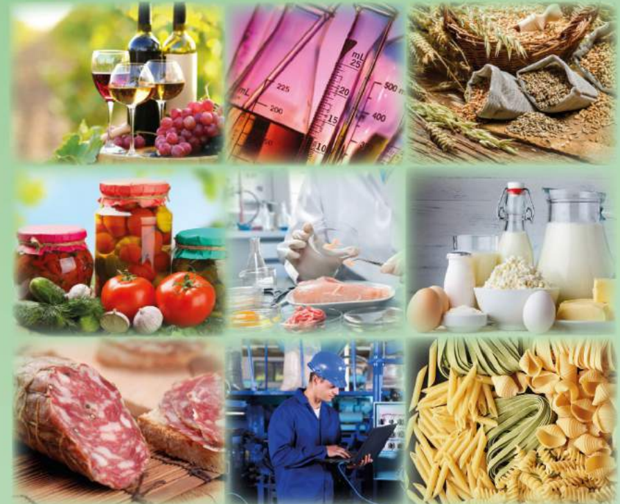
Full-time training course for all specialities - 4 years.